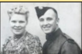
Photo found in a library book — If you recognise this photo please contact the school. It was found in a returned library book.